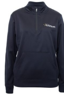
Quarter zip top