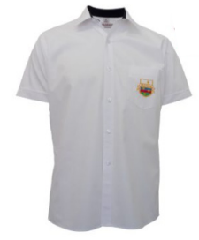
Shirt short sleeved