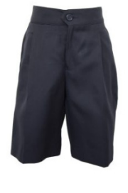
Shorts junior elastic waist